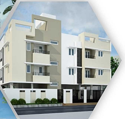
RESIDENCE AT NAGAMMAI STREET AMBATTUR