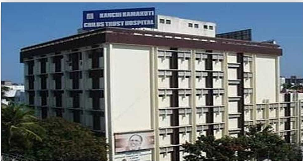
KANCHI KAMAKOTI (CHILD TRUST) HOSPITAL NUNGAMBAKKAM, CHENNAI