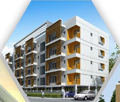
LAKSHANA APARTMENT PHASE -1