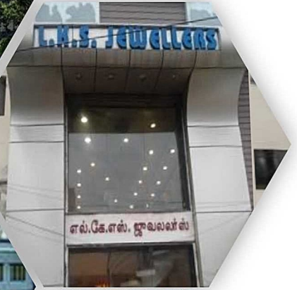
L.K.S JEWELLERS AT WALL TAX ROAD, CHENNAI