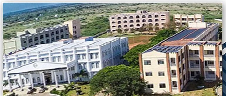
EINSTEIN COLLEGE OF ENGINEERING, TIRUNELVELI