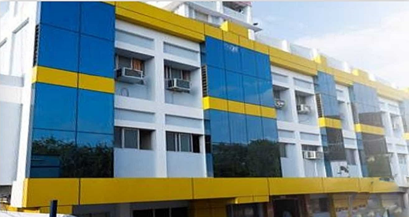
SHIFA HOSPITAL AT TIRUNELVELI