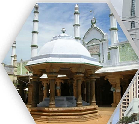
MASJID, KILAKARAI, [TBAK COLLEGE].