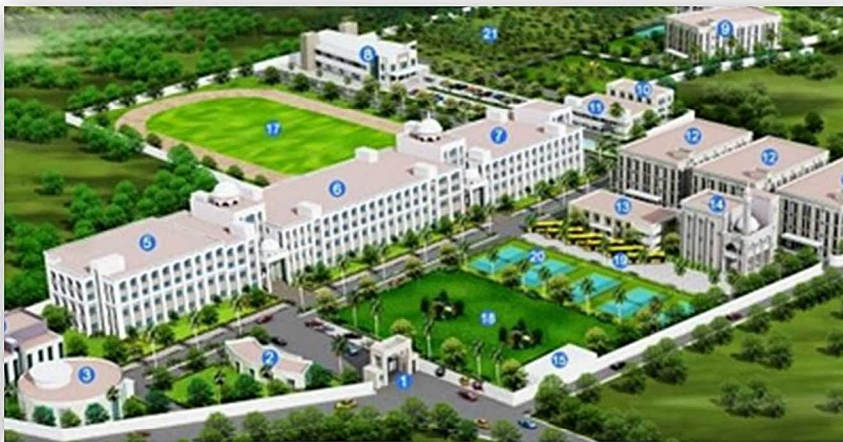
DHAANISH AHAMED COLLEGE, COIMBATORE