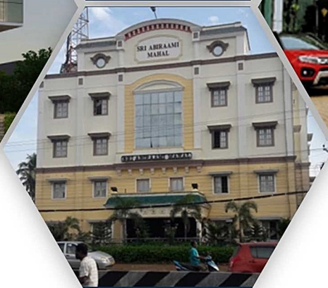
SRI ABIRAMI MARRIAGE HALL EAST TAMBARAM, CHENNAI