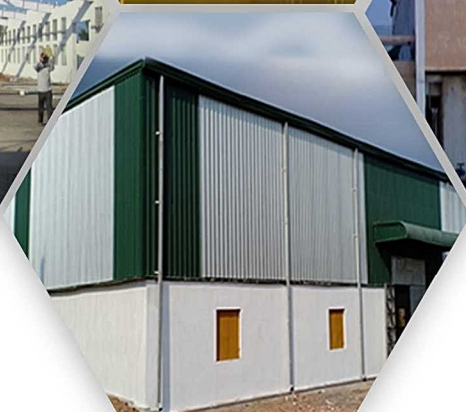
GODOWN STRUCTURE FOR MS NAMASIVAYAM