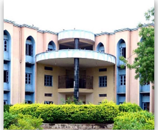
NATIONAL COLLEGE OF ENGINEERING, TIRUNELVELI