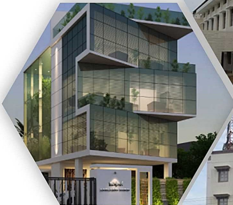
A.R.MURUGADOSS OFFICE AT ELDAM'S ROAD, CHENNAI