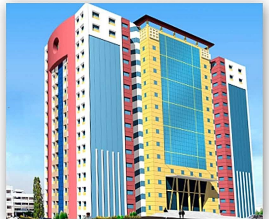
SRM IT PARK AT POTHERI CHENNAI