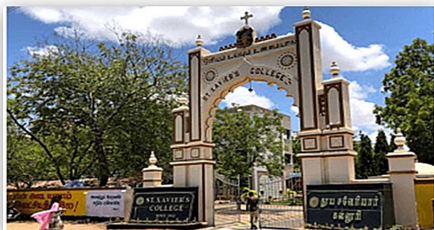
ST. XAVIER'S COLLEGE BUILDING, TIRUNELVELI