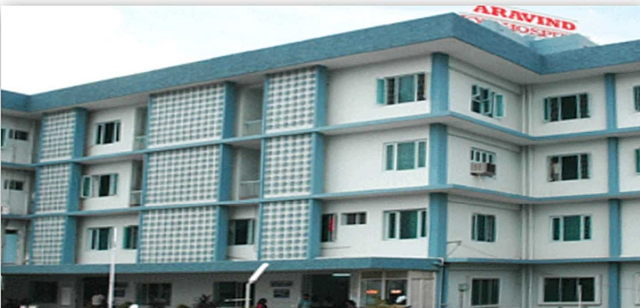
ARAVIND EYE HOSPITAL AT TIRUNELVELI