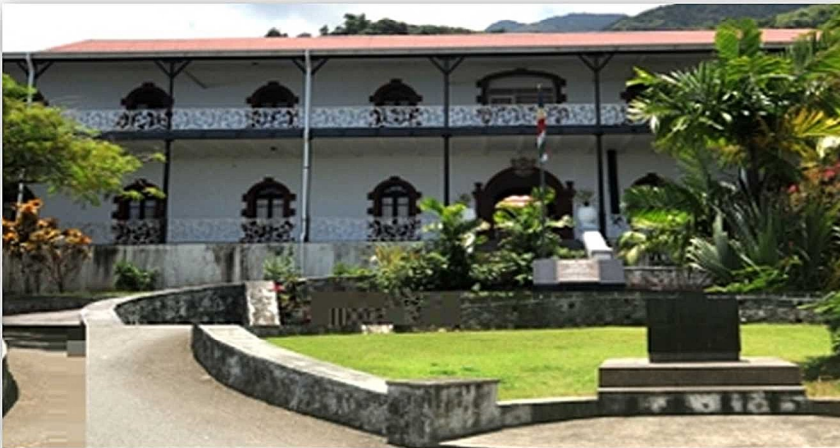
SEYCHELLES HOSPITAL BUILDING, SEYCHELLES