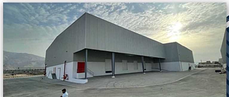
FOOD STORAGE WAREHOUSE AT MISFAH UNIT A, OMAN