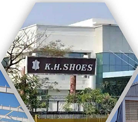
K.H. LEATHER FACTORY