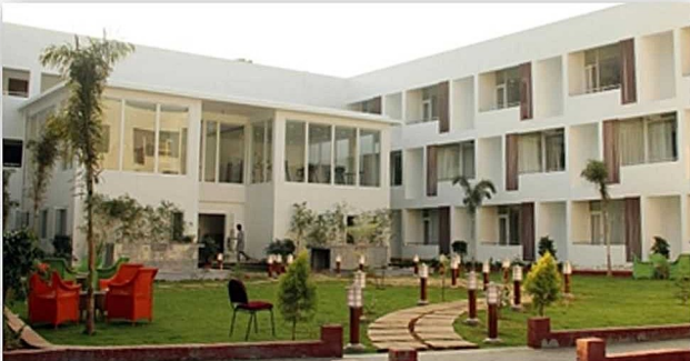
SARAAL RESORTS COURTALLAM