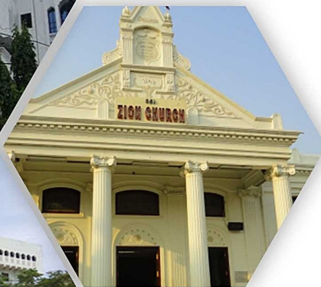
ZION CHURCH CHINTADRIPET, CHENNAI