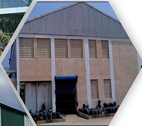
STEEL STRUCTURE BUILDING FOR VANITEC LIMITED AT VANIYAMBADI