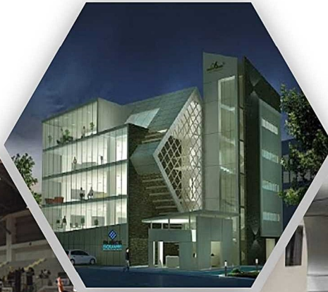
RUBICS SQUARE AT OMR KAZHIPATTUR