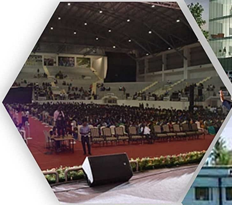
SAIRAM LEO MUTHU AUDITORIUM AT CHENNAI