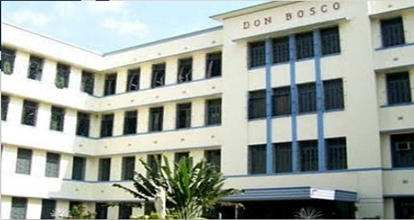
DON BOSCO SCHOOL, CHENNAI