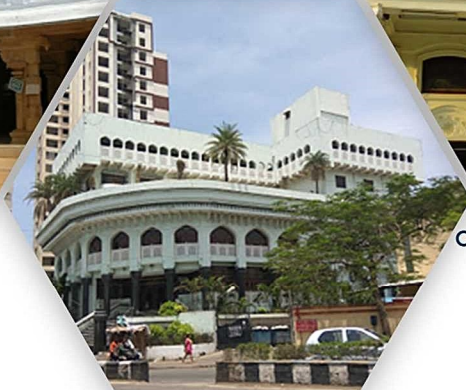
HAJHOUSE CHENNAI, BAITUL HAJJ