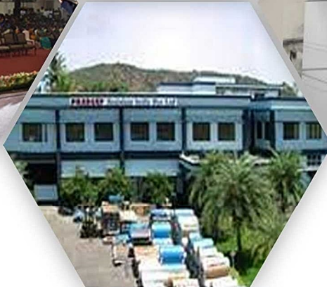
PRADEEP STAINLESS STEEL FACTORY BUILDING