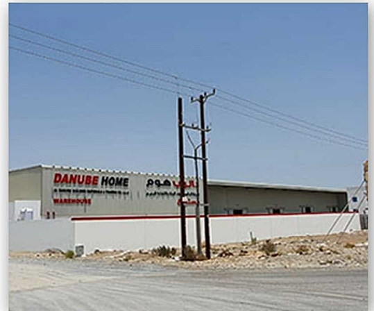
WAREHOUSE BUILDING FOR DANUBE HOME AT BARKA, OMAN