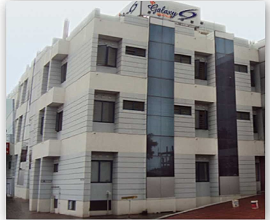
GALAXY HOSPITAL, TIRUNELVELI