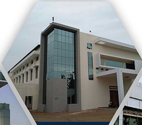
MOC AUDITORIUM AT TIRUNELVELI