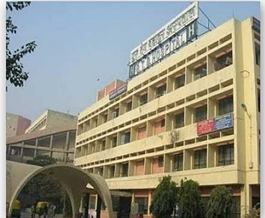
HOSPITAL BUILDING AT DELHI