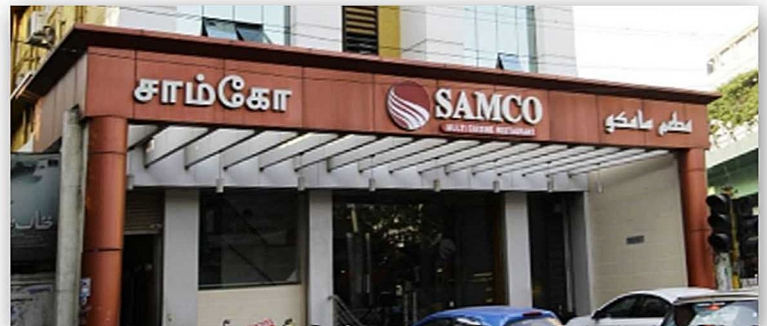
SAMCO RESIDENCY AT ELDAM'S ROAD, CHENNAI