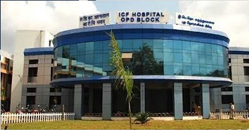
ICF HOSPITAL AT AYNAVARAM, CHENNAI