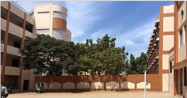
MEASI MATRICULATION SCHOOL, CHENNAI