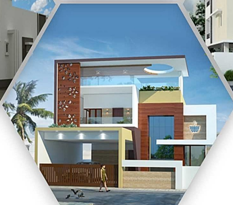
RESIDENCE AT KODESWARAN NAGAR, TIRUNELVELI