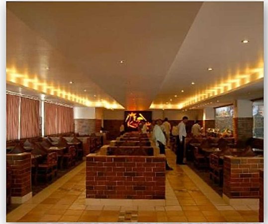
ARASAN GROUP HOTEL AT TIRUNELVELI