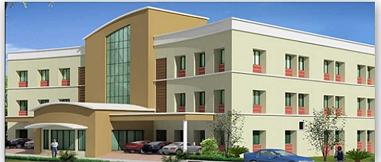
MADIN RESIDENTIAL COLLEGE AT MALLAPURAM, KERALA